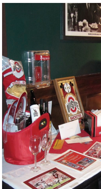
Items for raffle at a recent OSUWWM gathering — one great benefit of joining us at various events.