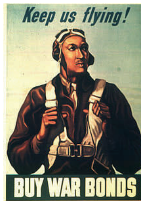
World War II Poster featuring a Tuskegee Airman